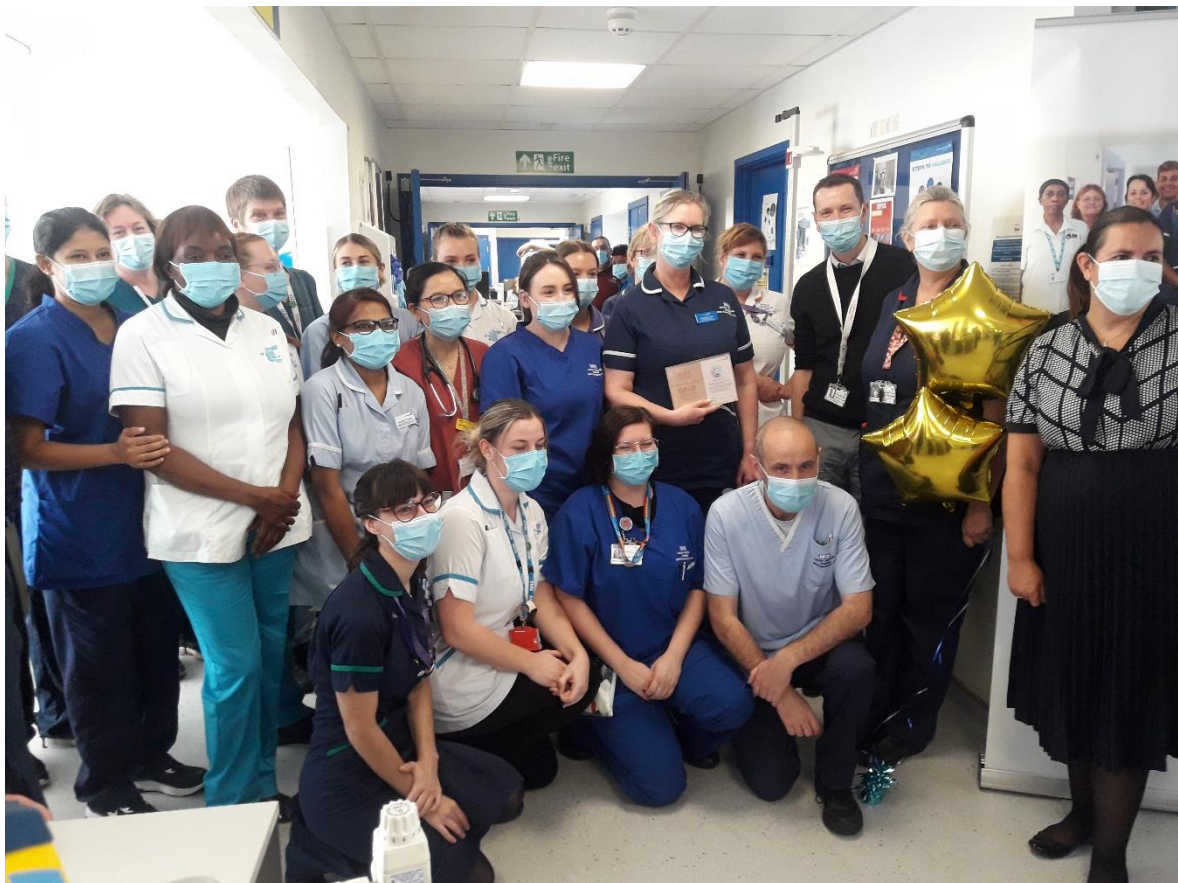
The Stroke Unit team at Oxford, celebrating a GOLD OxSCA (the OUH's departmental accreditation scheme)