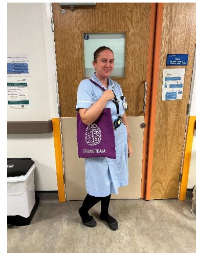
Stroke team at New Cross Hospital supporting world stroke day!