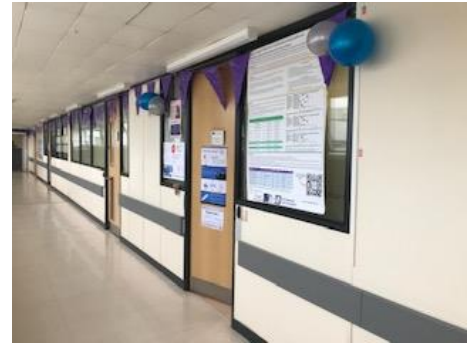
Oxford Stroke Research team celebrating Clinical Trials days May 20th, 2022